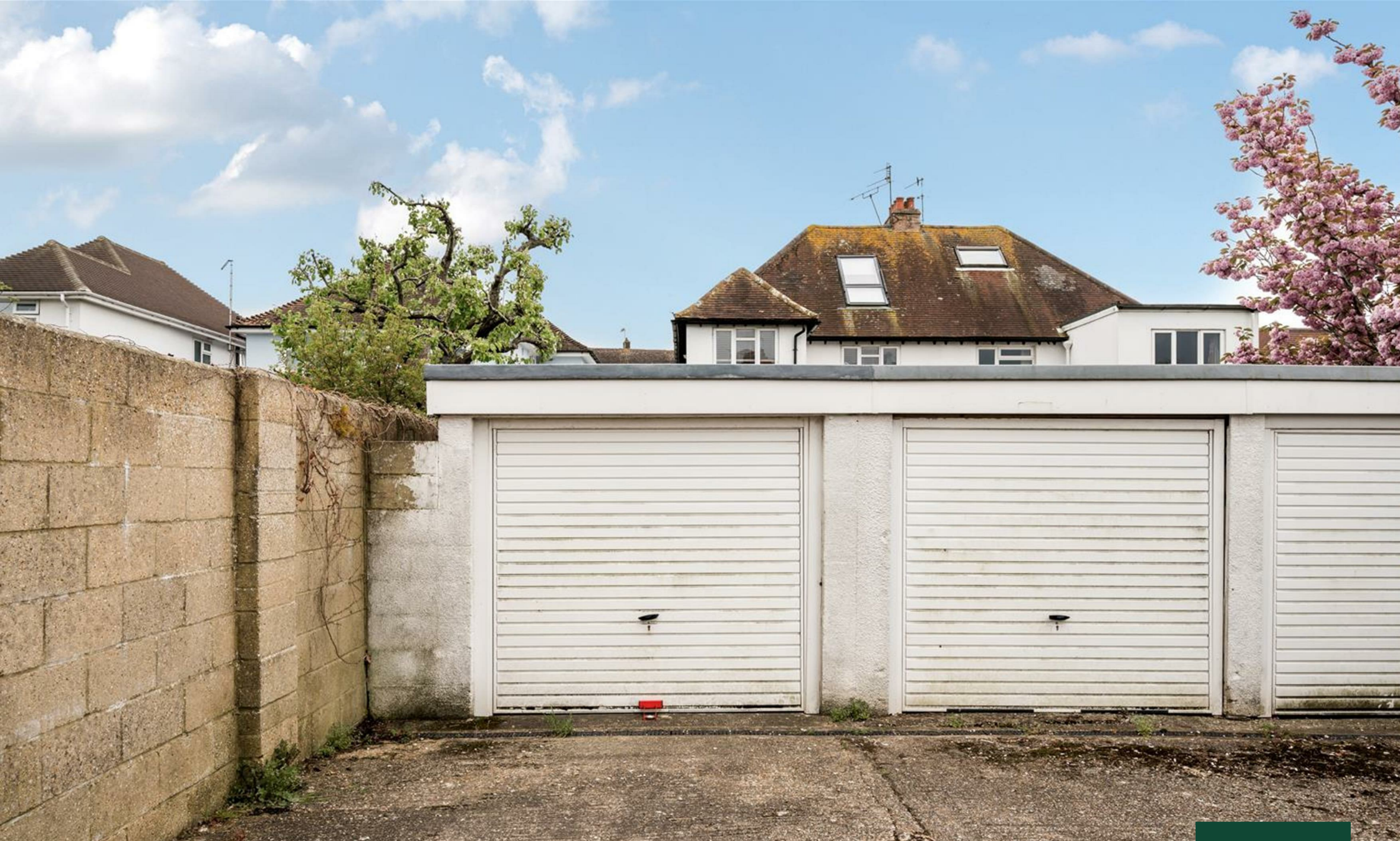
Garage C Oxen Avenue | | Shoreham-By-Sea | BN43 5AF